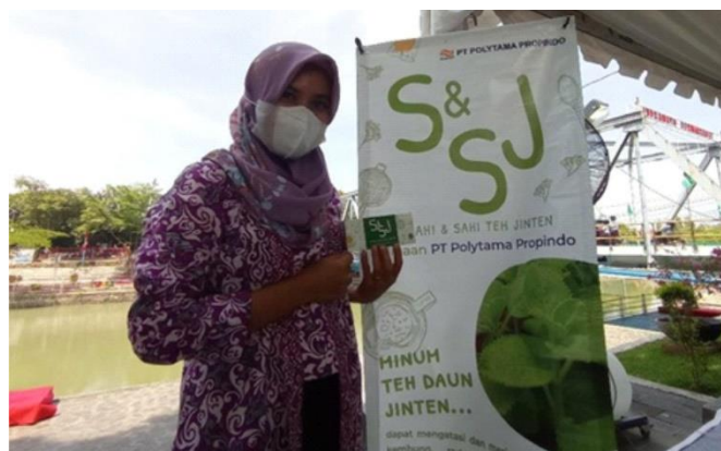
Figure 2. X-Banner Display of Cumin Tea Products

The advertising element has not been used optimally by CBO IBU TIN in marketing cumin tea products. The use is only limited to x-banner print media as product information media, not yet using other media (posters, brochures, electronic media, and other media). This is due to the limitation of raw materials so that cumin tea products cannot be produced in large quantities. Mutiah Suparta, as Chair of the CBO IBU TIN also conveyed the consideration of waiting for a distribution permit from BPOM, "If the distribution permit from BPOM has been issued, we plan to produce it in large quantities. So, for now, don't let the costs for promotion be greater than the production costs, we'll be in trouble later."