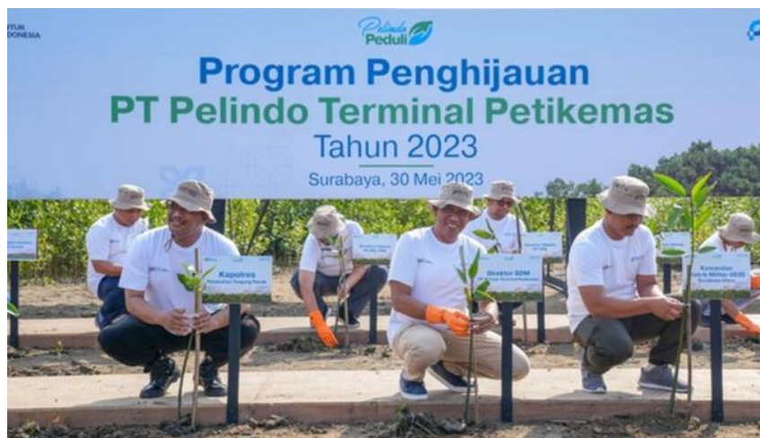
Figure 2. Pelindo Group's Mangrove Planting Programme

The mangrove planting activity involved the participation of Pelindo stakeholders, that is, the community around Sontoh Laut Tourism Village, as well as local government agencies in this case, in particular the Tanjung Perak Police Chief, the Head of the Tanjung Perak Port Authority, the Head of Tanjung Perak Harbourmaster, the Head of BPDAS Brantas Sampean, the Head of the Surabaya City Agriculture Office, Asemrowo District and local government officials, as well as several environmentalist communities. The impact is not only to participate in maintaining the ecosystem around the place but also a means of tourism education for visitors to the tourism village and the community in the area. Of course, this has more value than the environmental aspect, therefore the CSR programme of mangrove planting is very appropriate.