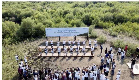
Figure 4: The Ceremony of Mangrove Planting Program of Pelindo Group

As we can see in this post, 4679 people have participated in these reels, the accounts reached from this post are coming from @pttps_official followers 1,825 and the rest are coming from outside or non-followers 2,418. This post also shows 239 likes, 6 people comment, 4 people share this post and 3 people save this post.