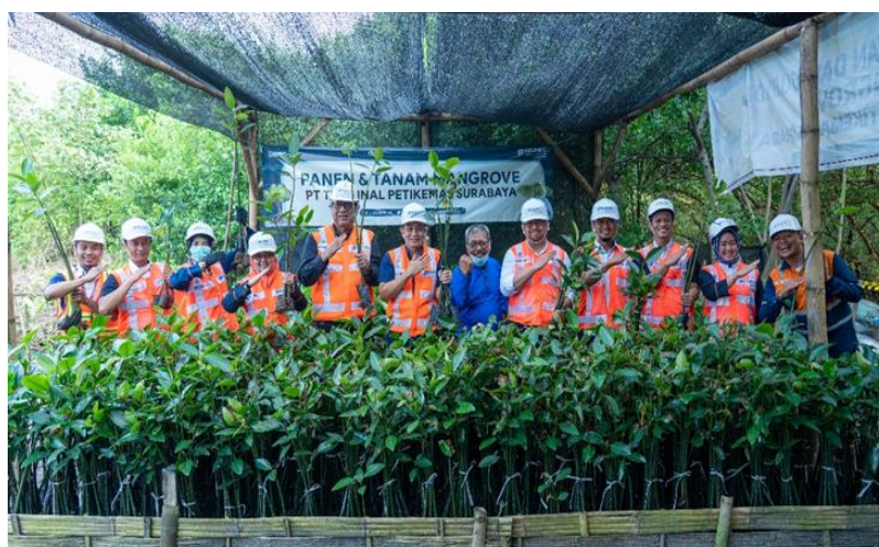
Figure 1. TPS Harvests 10 thousand seedlings of mangroves

Heikkila et al. (2022) state that ports serve as centres for logistics and supply chain management. They have specific demands for cost management, operational efficiency, security measures, and sustainability practices. A sustainable development concept integrating economic, environmental, and social considerations into decision-making is known as the triple bottom line. PT Pelabuhan Indonesia (Pelindo) then implements this concept. This port management company participates in establishing programs that prioritize social and environmental issues through its Corporate Social Responsibility (CSR) programme.